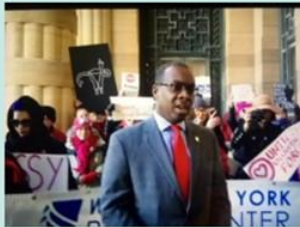
Image: Demonstrators behind the WNY Peace Center banner at a march for equal rights. One sign depicts a uterus giving the finger .